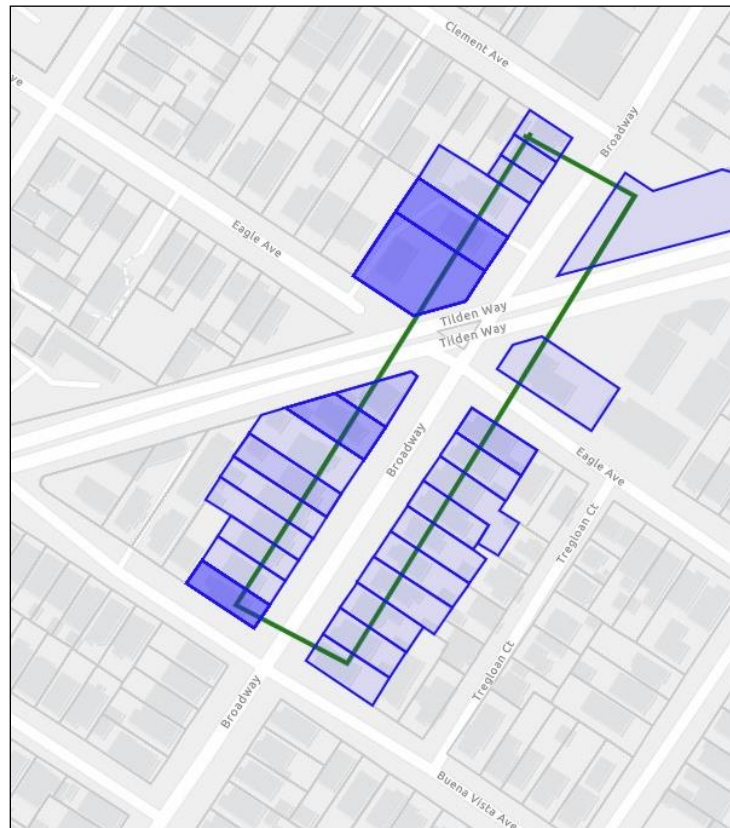
Broadway – Buena Vista Ave to Clement Street